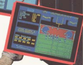
Screen shots taken from the IBM version.

AVAILABLE AT YOUR FAVORITE SOFTWARE STORE: