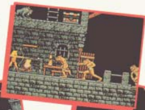
Screen shots taken from the Amiga version, other formats will vary.