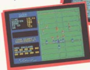
QUARTERBACK™ is a trademark of Tradewest